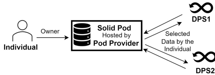
Figure 3: Solid environment for compliance with the DA's DPSPs mandatory data sharing.